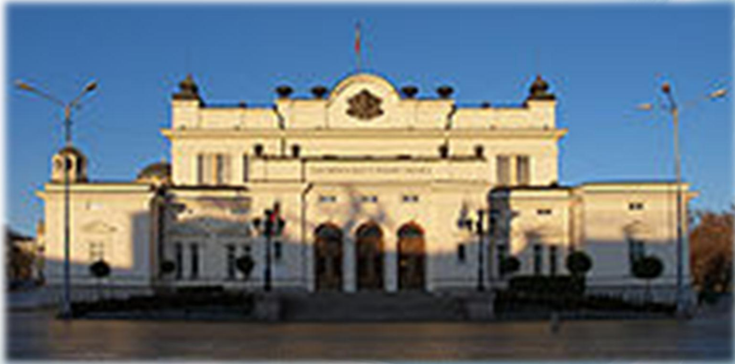
The building of the National Assembly in Sofia.